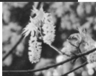
Left: The big leaf maple produces fragrant male and female flowers on the same graceful stem.