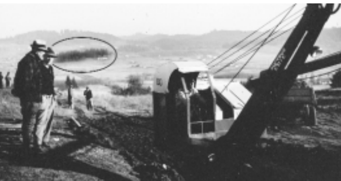
Above: The Masonic Cemetery and Hope Abbey viewed from the College Hill Reservoir in 1938.