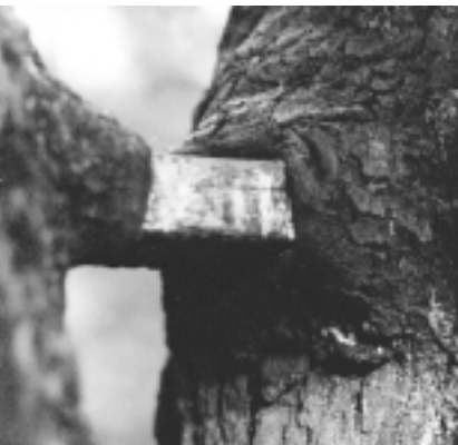
Trees heal by growing new wood over their injury.

Many of the cemetery's Douglas-firs have a curious bulge part way up their trunks. These bulges developed after the trees had their tops cut off more than 60 years ago. Over time, each tree developed a new top from a lateral branch, just below the cut. In the early years, the trees had a very noticeable crook at