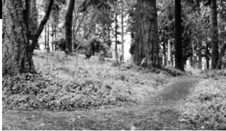
Two miles of trails course through the cemetery's mature dry fir forest.

Following the cessation of burning scattered trees grew in the nearby hills and the indigenous trees naturally seeded and took hold. Early pho-