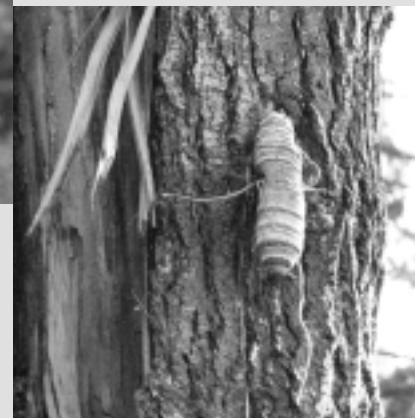
The quinine conk adds a new spore producing layer every year.