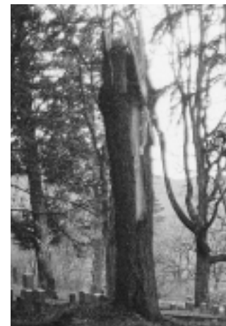
One of three snags providing habitat.

ty nearly 25 feet from the ground. When the tree snapped, the honey comb scattered. The sweet bounty was retrieved and enjoyed by neighbors. Both of these "snags" have been retained to provide cavity habitat for birds, insects, and other creatures that rely on the dead trees for feeding, roosting, or nesting.