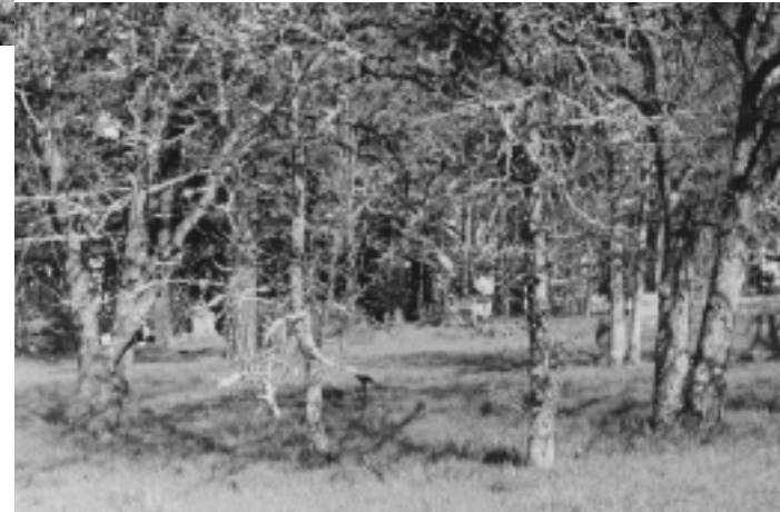
Several acres of oak woodland and savanna lie east of the mausoleum.

The cemetery has one native broadleaf evergreen, the madrone. The cemetery's other broadleaf evergreen species, the laurel and the holly, like the yew, were deliberately planted in the cemetery for memorial purposes. Since the