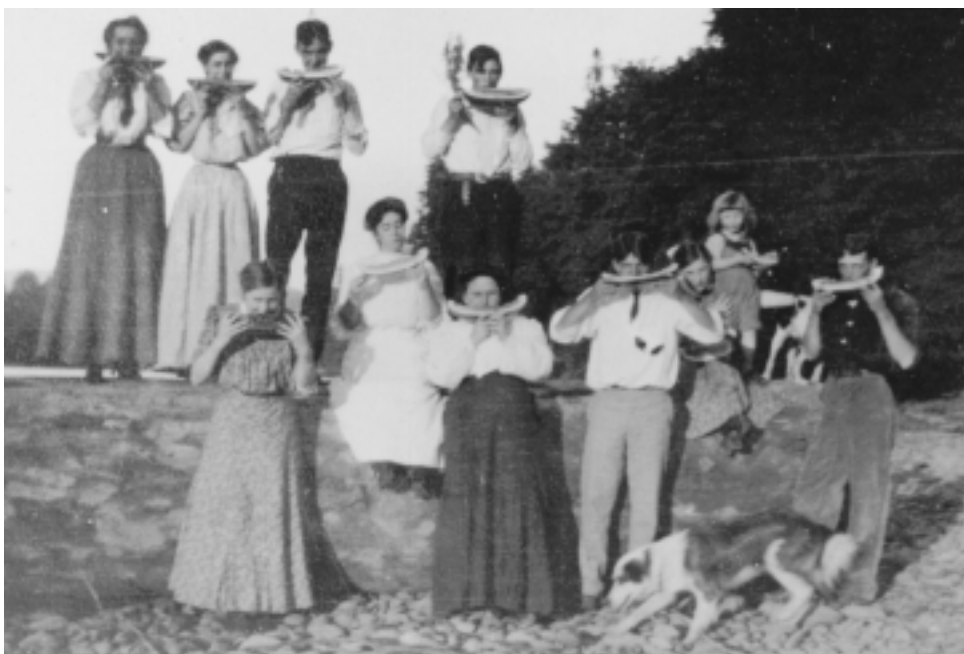
Left: Picnic entertainment, ca. 1915.